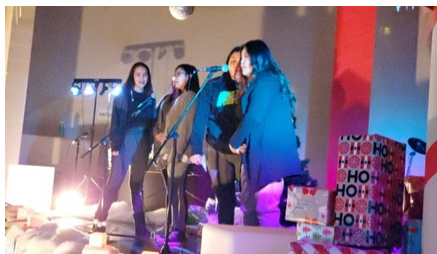
High School Students singing Rocking Around the Christmas Tree during the Christmas Concert