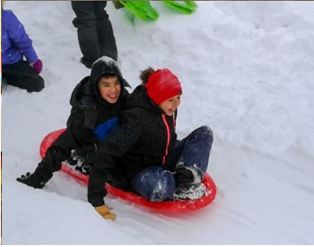
Students from Grade 1, 4, 5, and 6 go on one last sledding excursion before the Christmas break.