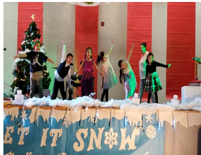
K5 students showed their Ginger Bread Man Skit and Dance