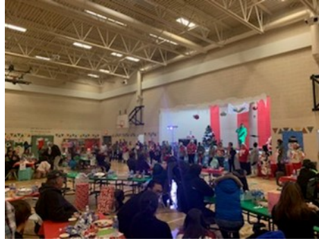
Band Staff Christmas Party Highlights the 24 amazing contestants for Ugly Sweater Contest