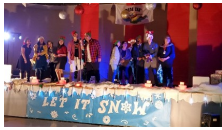
DTCS staff entertaining the crowd with their Feliz Navidad rendition.