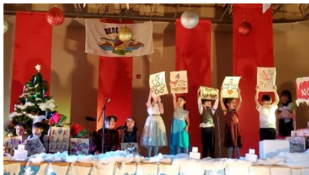
Gr. 2s with their 12 Days of Christmas