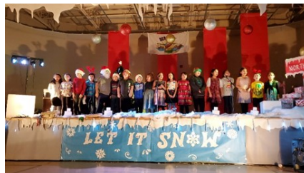
Gr.3s singing We Wish You a Merry Christmas and sharing Jokes