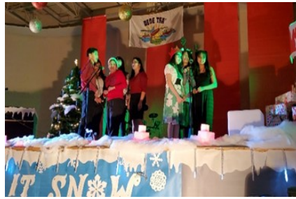
Gr.6s singing Last Christmas during Christmas Concert