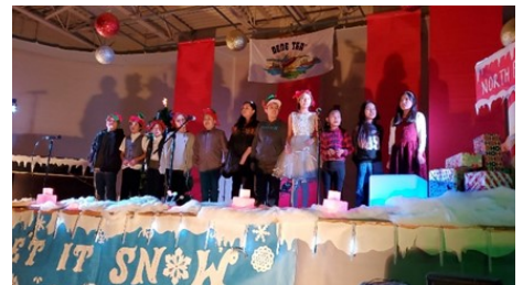
Gr.4s singing Jingle Bell Rock