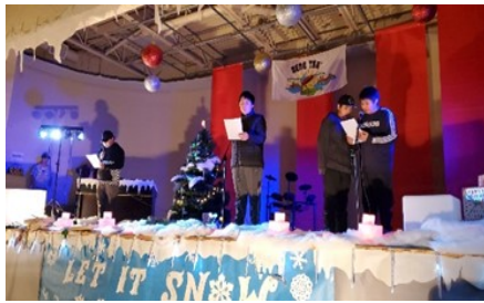
GGr.7 boys taking their part during the Christmas Concert