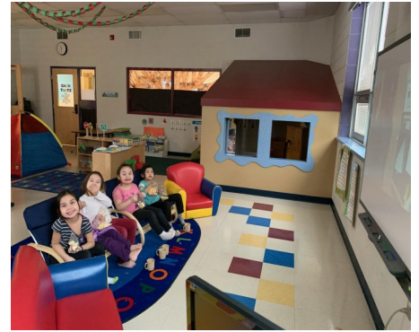
Break time for movie and popcorn.