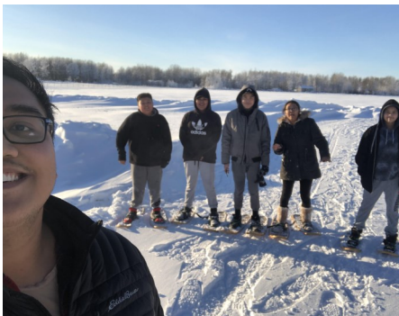
Students snowshoeing around the school

I hope everyone has a wonderful Christmas break. Coming back to school can be difficult after a long break, but the grade 8/9s are off to a fast start. We are moving along quickly in math, now focusing on percentages, fractions, and decimals. The students are also beginning to wrap up their science unit. All subjects will be tested on January 29 so keep hitting the books! Some of the students also had the chance to par-