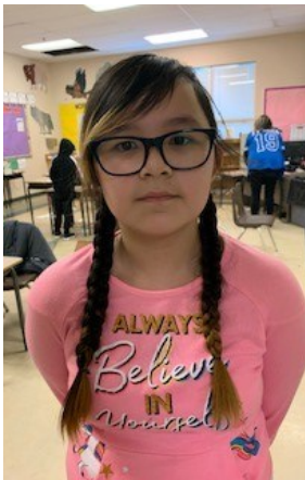
Bless N. Gr. 4- "I like GRACE Night because of the Wrestling and Basketball."