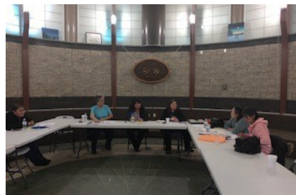
Dene Tha' Education Authority Board of Education holds meeting at the DTCS Culture room.