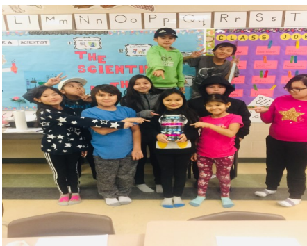
Our Marble Jar is half full! With good behaviour we will have our jar full and have a class party!

What a great start to the 2020 school year! The grade 4 students have been learning about simple machines and will soon start building devices and vehicles that move. In math class we have been learning about perimeter and are making our own zoo farm, keeping the measurement of perimeter in mind! We have started to learn about the writing process and the steps it takes to brainstorm, write, edit and publish our work. Topics the students chose include the Solar System, the