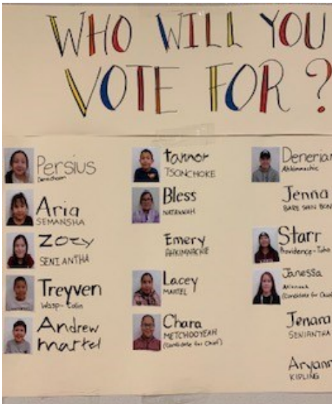
Student leaders campaign for their seat on the Student Mini-Chief and Council