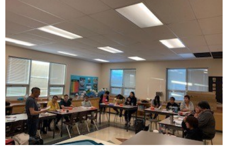
Twelve (12) staff and four (4) HS students take First Aid Course.