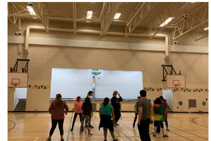
Wolves practice before their Super Saturday games

“The roots of education are bitter, but the fruit is sweet” - Aristotle