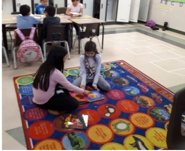
Buddy Reading. Half of the class is reading in the grade 3 classroom while the other half remains in our room.