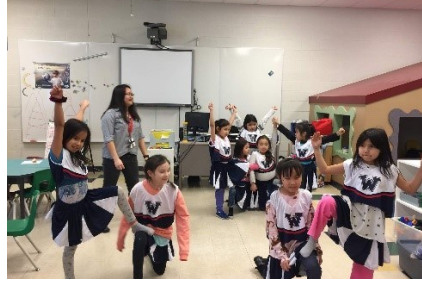
DTCS Cheer Leaders practice during lunch time.