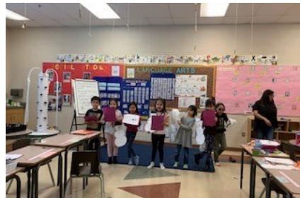
Gr. 1 students display their poem recitation talent during the principal's visit.