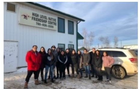
Indigenous Youth Mentorship Program group poses at High Level Native Friendship Centre. Four(4) Staff, three (3) HS students, 5 JH students and one (1) Gr.6 student represent DTCS in the IYMP sponsored by EverActive