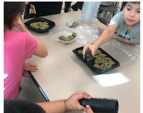
Biology Class. Planting their seeds for the plant tower.