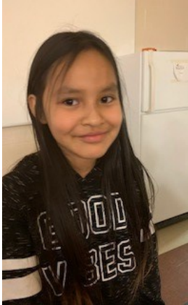
Destiny W. Gr. 4- "I like GIRLS' NIGHT because of the snacks"