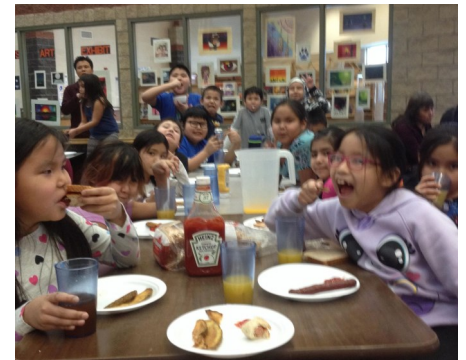
Working on our table manners in the lunch area.