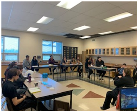
Lori A. orients staff about the sudden cancellation of Teacher's Convention and the possible effects of COVID-19 to classes.

Like other schools in the province and around the world, DTCS closed its door to the public and suspended classes indefinitely, March 16.