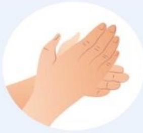
Apply soap and rub palms together