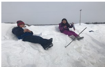
Children have snack breaks during their Habay Ice Fishing Trip, March 6.