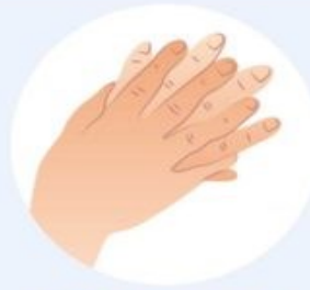
Spread the soap lather over the backs of hands