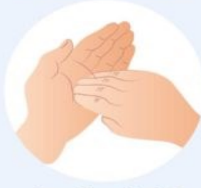
Press fingertips into palm of each hand