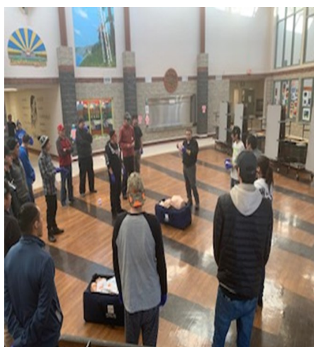
Economic Development conducts Safety Courses for Twenty Members. Safety Courses enable workers to qualify to work in Industrial Field.