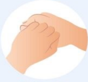
Grip fingers on each hand