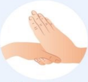
Make sure to clean thumbs