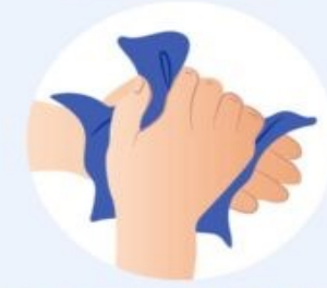
Dry thoroughly with clean towel or paper towel