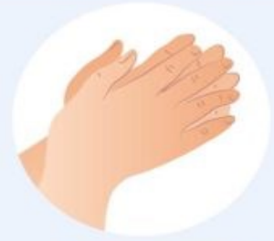
Make sure soap gets in between fingers