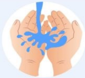
Wet hands under running water